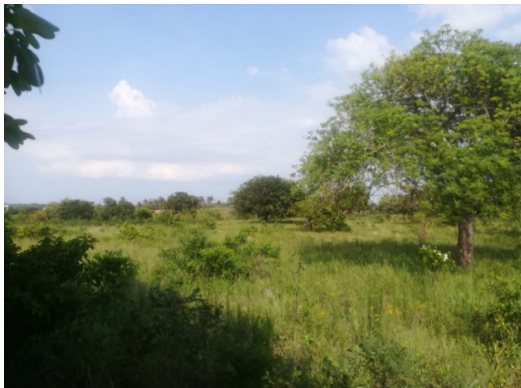
Actual site pictures