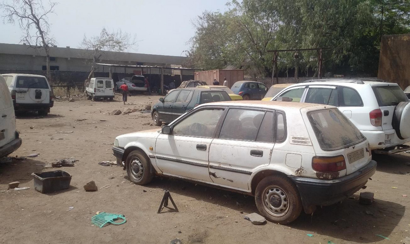
◀ Plot interior from North to South