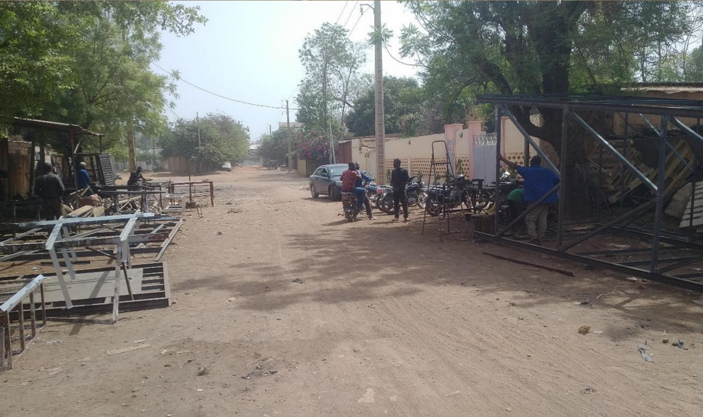
◀ View of Rue 96