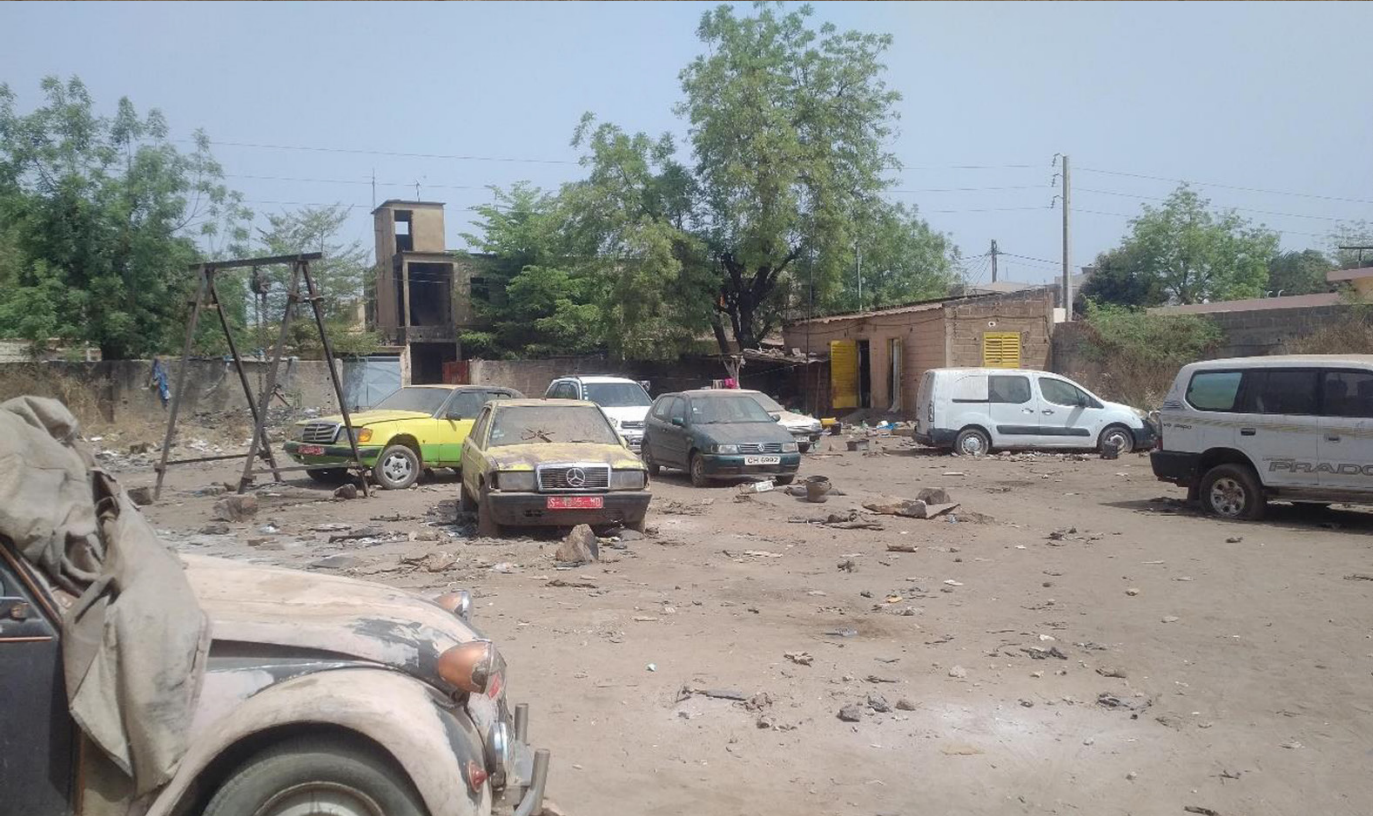
◀ Plot interior from South to North