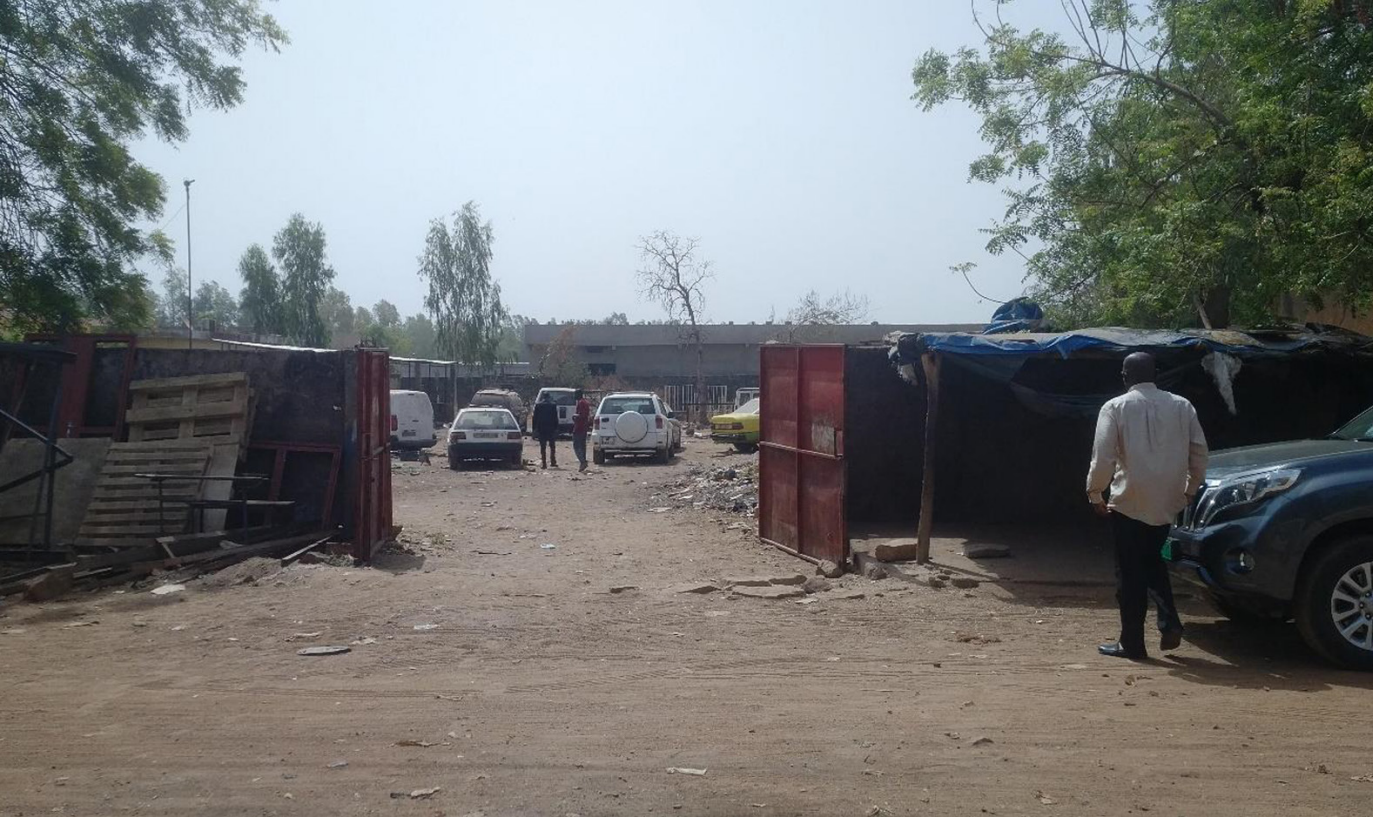
◀ Main entrance from Rue 96